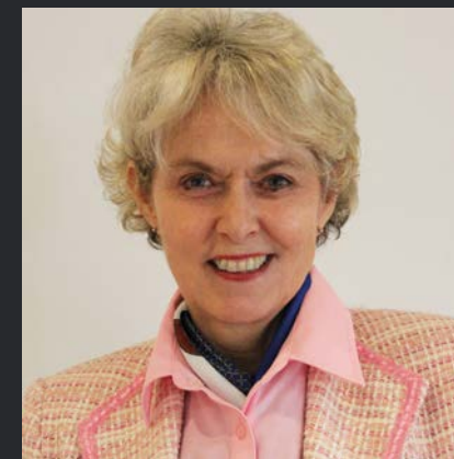
Baroness McIntosh of Pickering , Member of the House of Lords